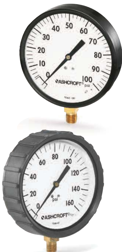
Shown with Optional Rubber Boot