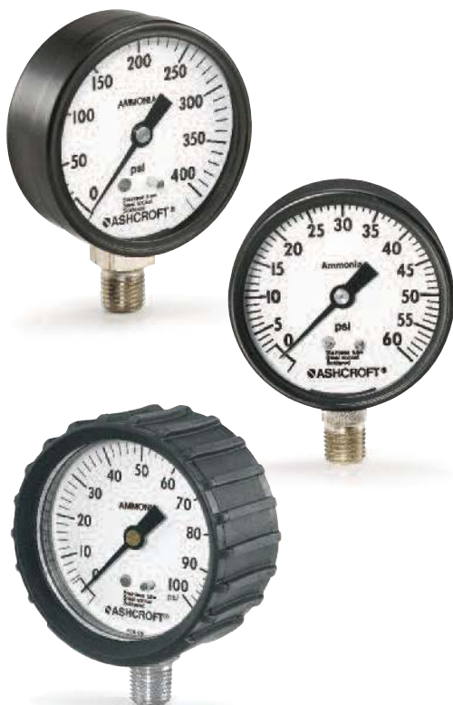
Shown with Optional Rubber Boot