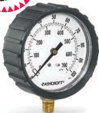
Shown with Optional Rubber Boot