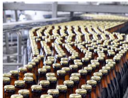
Leak monitoring in filling plants (safety)