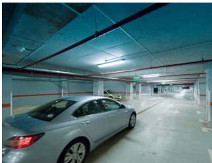
Monitoring in underground garages (safety)