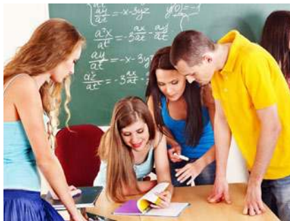
Indoor air quality