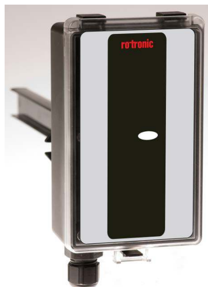
Figure 1 CF5 for wall mounting and duct mounting