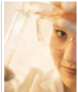
Healthcare, the sciences