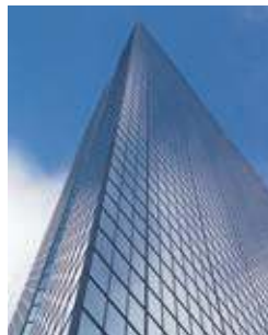
HVAC / Building management