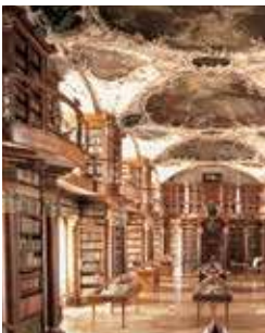
Museums, art galleries

The HygroPalm2-series (with integrated or interchangeable probes) is ideal for all applications where exact measurement of humidity and temperature is of decisive importance, e.g. the food and pharmaceutical industries, printing and paper industries, many trades, the sciences, meteorology, agricultural sector, climatology, etc. There is hardly a field today in which these parameters may be ignored. It is ultimately the measuring task at hand that defines the HygroPalm instrument that best meets your needs.