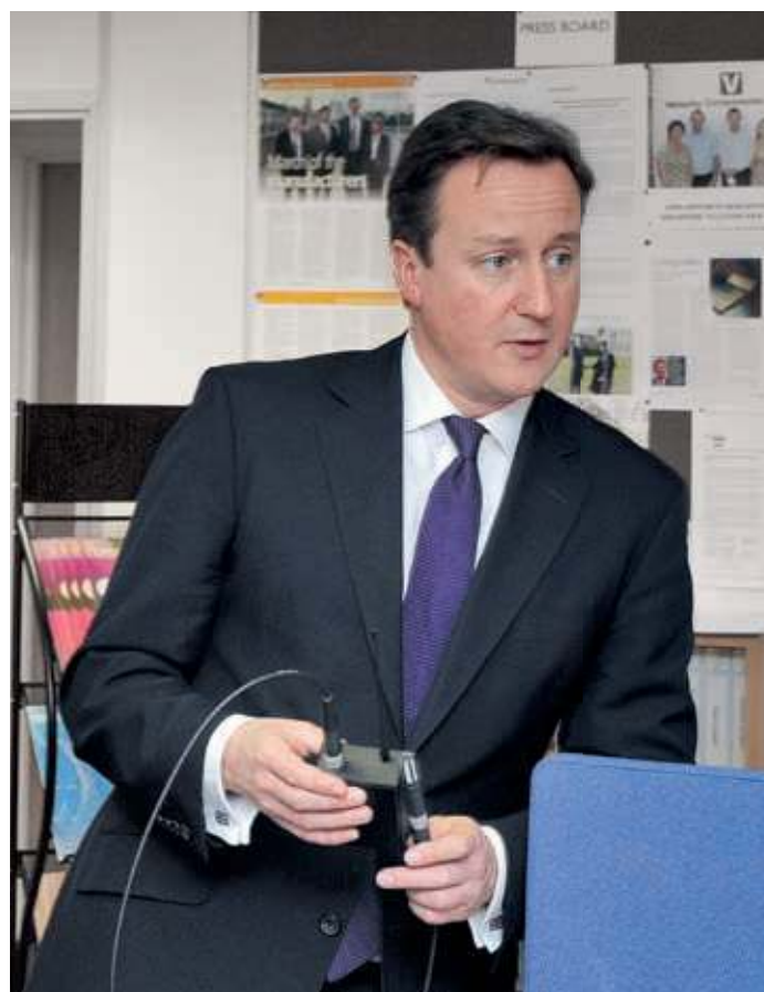
Even British prime minister David Cameron knows the HygroClip2 probes from Rotronic.

Meaco Measurement & Control has been using Rotronic temperature and humidity sensors for more than 20 years. Meaco helps clients such as museums to store their collections under perfect conditions. They use HC2-S standard sensors in wireless monitoring systems and control instruments. Meaco works with conservation organizations throughout Europe and with the National Library in Cairo. To monitor valuable artefacts discretely, sensors can be connected to extension cables.