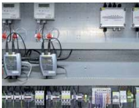
Measurement equipment in switch cabinet.

The MicaFlex MF-PFT differential pressure sensors boast accuracy of \pm 0.5\% \pm 0.5 pa with very low zero drift. The two analogue outputs were used in the project to operate monitoring and room pressure regulation from a transmitter.