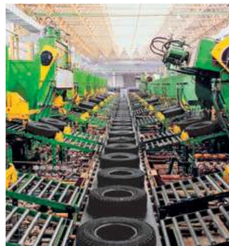
In the manufacturing process for steel radial tyres, multiple components are assembled using a special moulding machine. The environment in this area must be kept at 25 \pm 3 °C and 55 \pm 8 %rh.

The transmitters were installed horizontally on support columns and the sensors positioned a certain distance away from them to ensure correct monitoring of the environmental conditions. Thanks to the professional experience and support of Rotronic, the system has been working well for more than two years with consistent measurement accuracy and reliable performance.