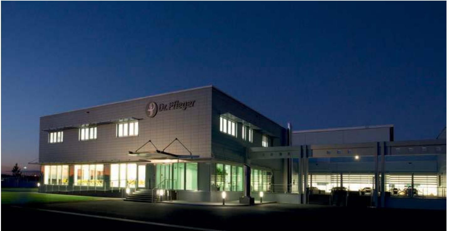
Dr. R. Pflieger GmbH in Bamberg (Germany).

Production monitoring and technical facility management at Dr. R. Pflieger GmbH.