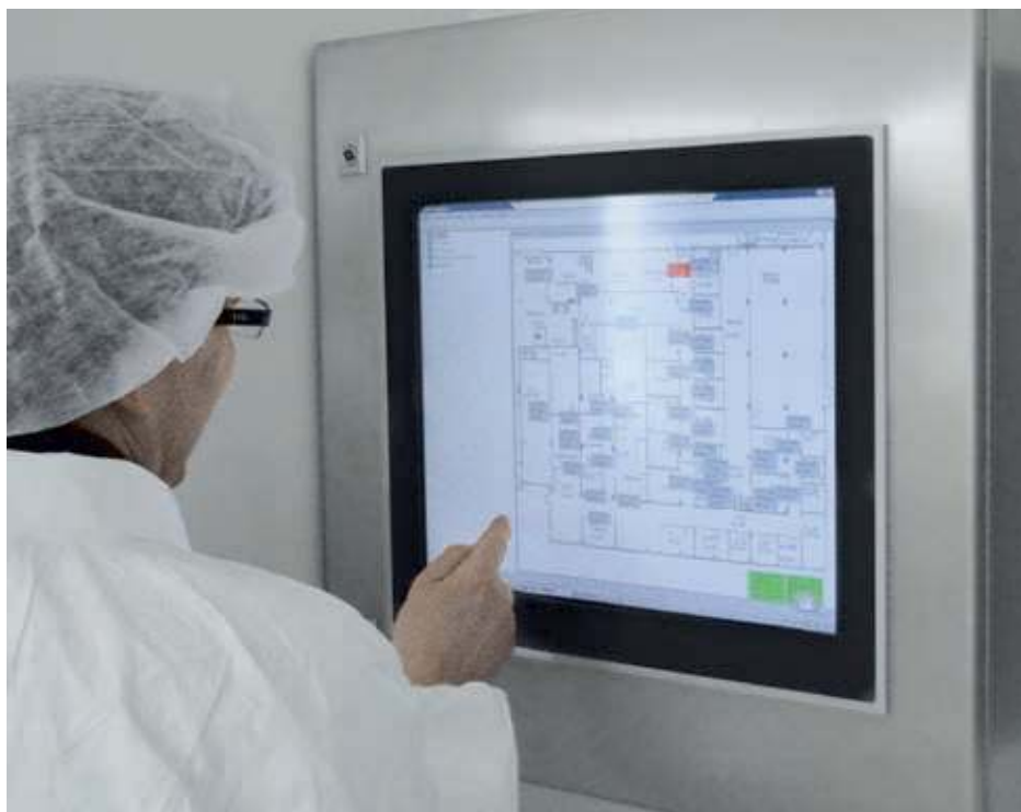
Technician checking the alarm schematic.

The automation, management and monitoring solution implemented by Hermos and Rotronic offers a consistent solution for technical facility management and thus the prerequisite for cost-optimised plant operation. Since all main and secondary installations and the monitoring system itself are integrated in the FIS management system, they can be monitored and controlled via a central software platform. Due to the open structure of the system and clean separation of the monitoring system, plants from the production area as well as plants in the existing building can in future be integrated in the central monitoring and control system seamlessly. The monitoring system can be extended at any time without additional licence fees or external programming.