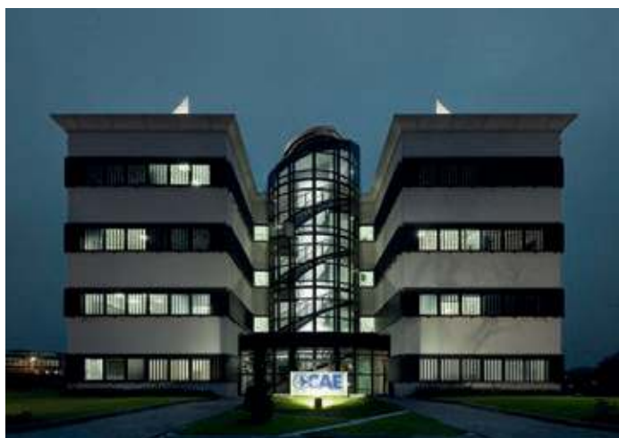
CAE headquarters in Bologna (Italy).

CAE was established in 1977. Its aim: to supply advanced technologies to public and private institutions to monitor environmental risks attributable to natural and especially hydro-meteorological phenomena.