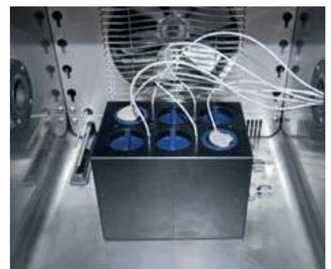
Tests in the climate chamber.

For example, at the new upper limit of 90 °C/95 %rh the projected CMC is anticipated to be \pm 2 %rh and with these levels of calibration measurement uncertainty and range of accredited calibration services the purpose-built calibration laboratory at Rotronic UK will be one of the most advanced commercial facilities in the world.