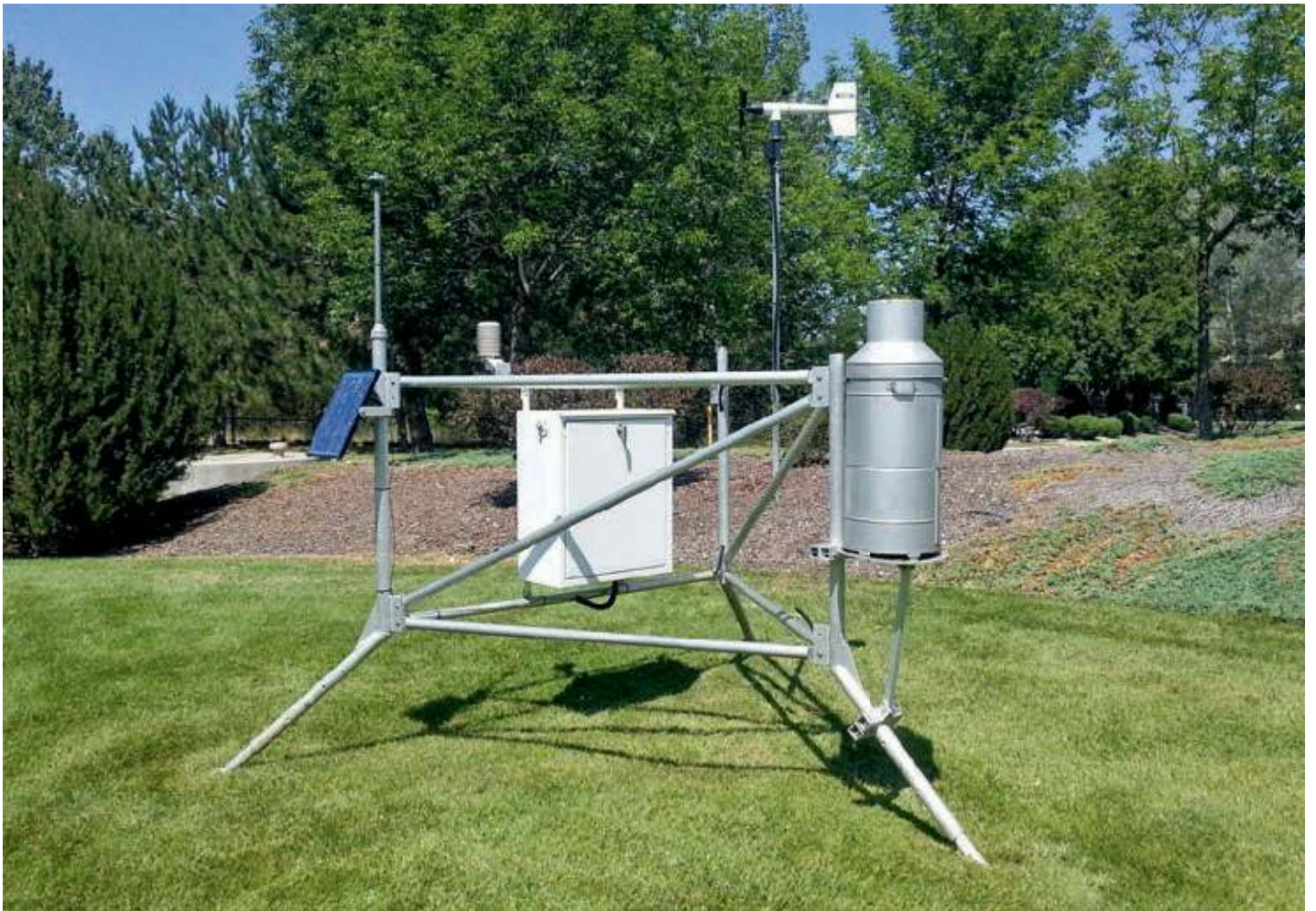
AgriMet station in Boise, Idaho.

Serving the Pacific Northwest, a meteorological information system conserves energy and water through crop specific water use.