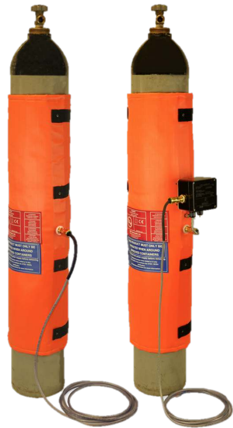
Standard heating jacket and heating jacket with thermostat fitted

A self limiting temperature of around 30°C above the ambient temperature will be maintained on the gas bottle wall when operated at 240v (with a 20°C ambient temperature, the gas bottle wall temperature will be around 50°C). If lower temperatures are required, the heating jacket may be fitted with a thermostat (0-50°C), allowing the user to reduce the heating jacket temperature. The thermostat must be adjusted whilst the jacket is situated within a safe area.