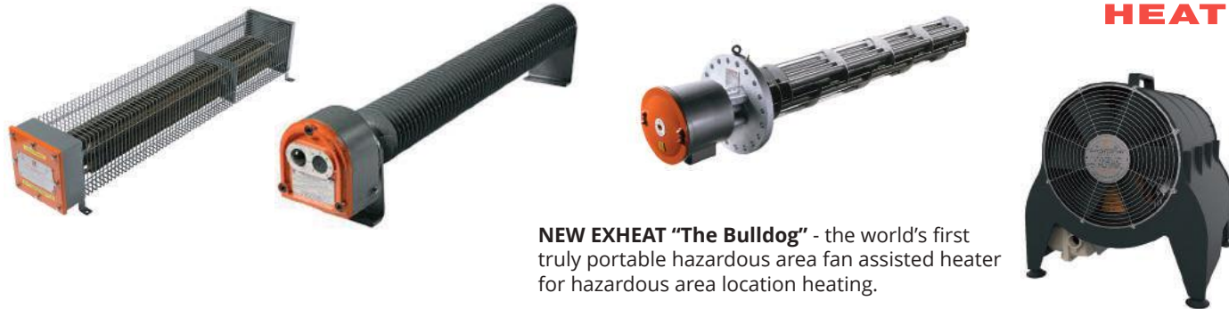
NEW EXHEAT "The Bulldog" - the world's first truly portable hazardous area fan assisted heater for hazardous area location heating.

Hazardous area electrical heating provides frost protection and process temperature maintenance of liquids and gases in potentially explosive atmospheres, including Zone 1 and Zone 2.