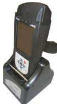
i.roc 420 with scannermodule and optional handgrip inserted in dockingstation

*not all i.roc x20 types provide full functionality in the way described before or are accessible by enduser