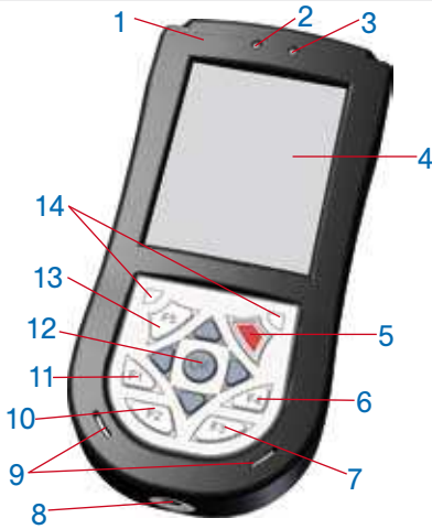
Front and bottom panel components