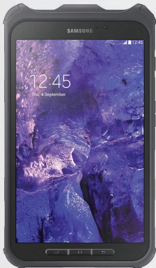
Galaxy Tab® Active (WiFi)

AN EVERYDAY RUGGED TABLET FOR ENTERPRISE WORKFORCES