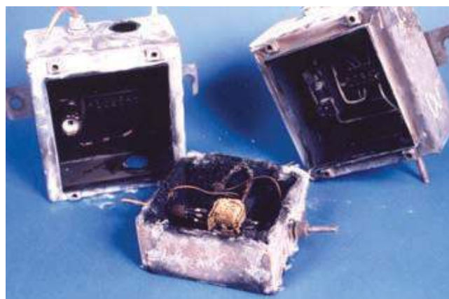
SX and BPG Range Enclosures after BS6387 Testing