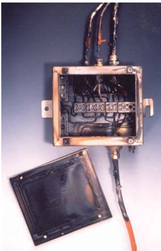
SX Range Enclosure and Cables after IEC331 Fire Testing