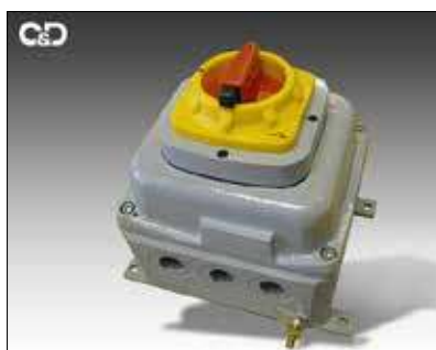
Typical small assembly

All load switching interiors are supplied as either 3P+N (switched neutral) or 6P and have AC23A ratings to BS EN 60947-3. Auxiliary contacts are available for applications such as SCADA packages. Finish - RAL 7035 Two pack grey epoxy coating over etching primer.