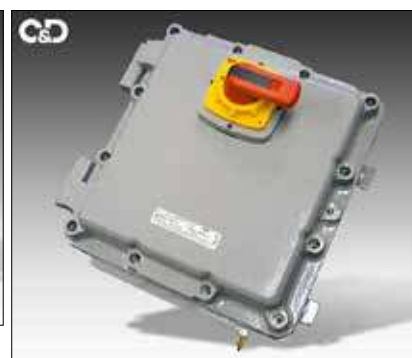
Example of a 100A assembly