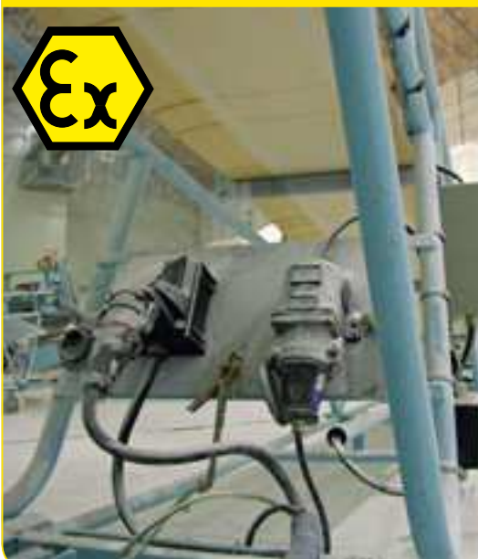
DX Locked socket*