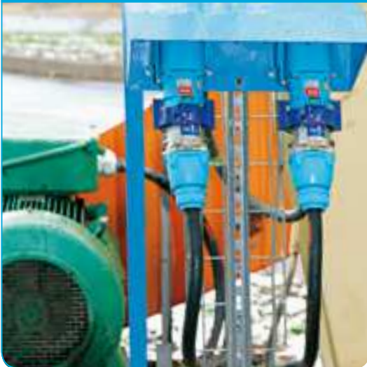
Padlocked in ON position*