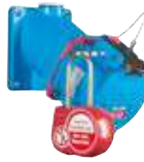
Plug locked in socket*