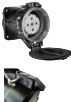
DXN Locked socket*