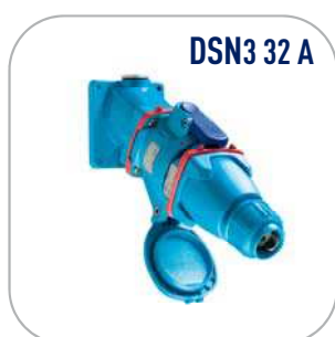
DSN3 32 A