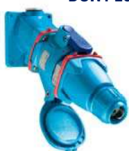
DSN1 20 A