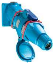
DSN3 32 A