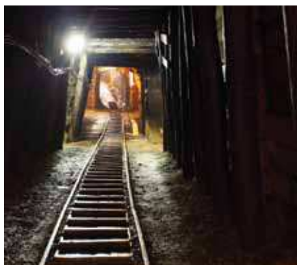
| iCAM501 Ultra has ATEX & IECEx M1 mining approval