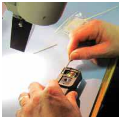
| iCAM501 Assembly in the Extronics Vision Lab

Over the past five years Extronics has made substantial investment in R & D, technical skills and production equipment to create a range of vision solutions that deliver real value to customers.