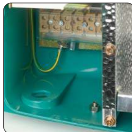
Cable entry and termination block