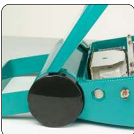
Hinged lens opening