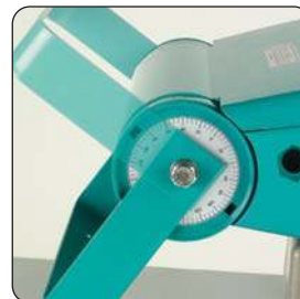
Adjustable angle mounting stirrup