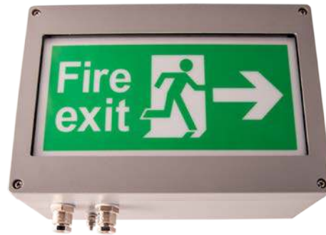
Image shown features running man with arrow suffix