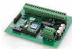
Addressable output module (open-collector)