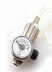
Test gas cylinders and regulators