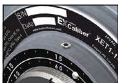
Dial locking screw

The XET1 electronic thermostat is also available as a built-in option on all sizes of Hazloc Heaters™ AEU1 explosion-proof electric air heaters.