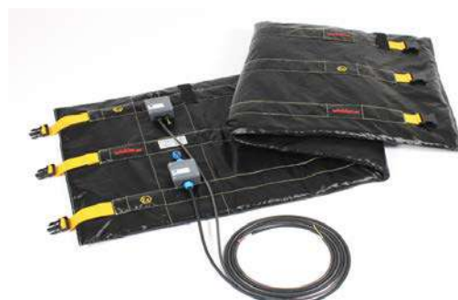
Examples of heating jackets WEXH... and ATEX digital-controller-combination WEXRBL25-230ZE000