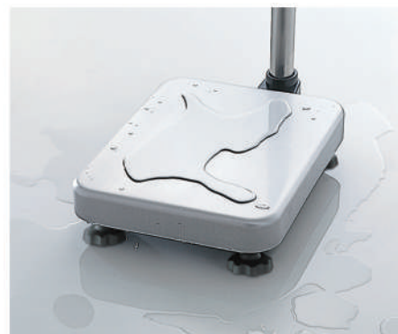
IP65 base unit with a SUS430 pan

In addition to being intrinsically safe, the base unit of the HV-CEP/HW-CEP series can be washed with water and can weigh wet objects without problems. Further, the surface of the pan is resistant to chemicals, scratches and rust, and easy to keep clean and hygienic.