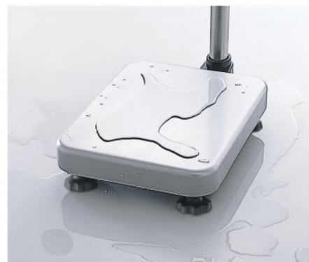
IP65 base unit with a SUS430 pan

In addition to being intrinsically safe, the base unit of the HV-CEP/HW-CEP series can be washed with water and can weigh wet objects without problems. Further, the surface of the pan is resistant to chemicals, scratches and rust, and easy to keep clean and hygienic.